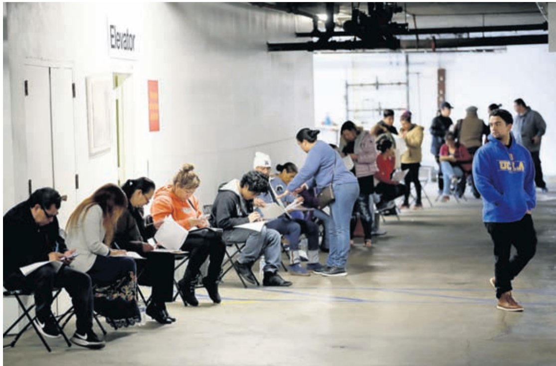
In this March 13, 2020 file photo, unionized hospitality workers wait in line in a basement garage to apply for unemployment benefits at the Hospitality Training Academy in Los Angeles. More than 6.6 million Americans applied for unemployment benefits last week, far exceeding a record high set just last week, a sign that layoffs are accelerating in the midst of the coronavirus.

Further signs of a surging wave of layoffs are likely in the coming weeks. Seth Carpenter, an economist at Swiss bank UBS, estimates that about one-third of last week's claims had